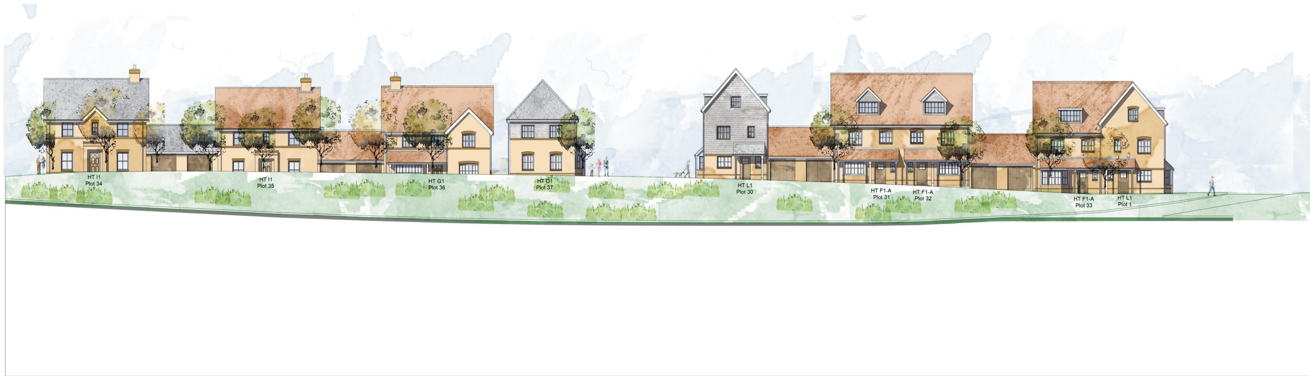
Street Elevation H-H scale 1:200